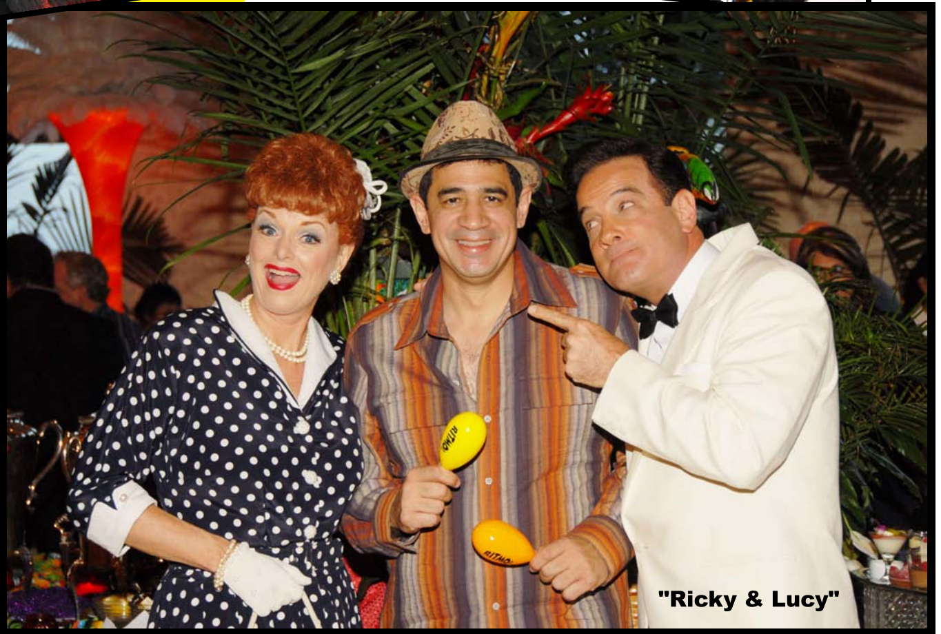
"Ricky & Lucy"